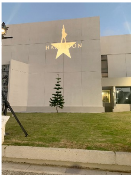
Bellas Artes Performing Arts Center ready for Hamilton!