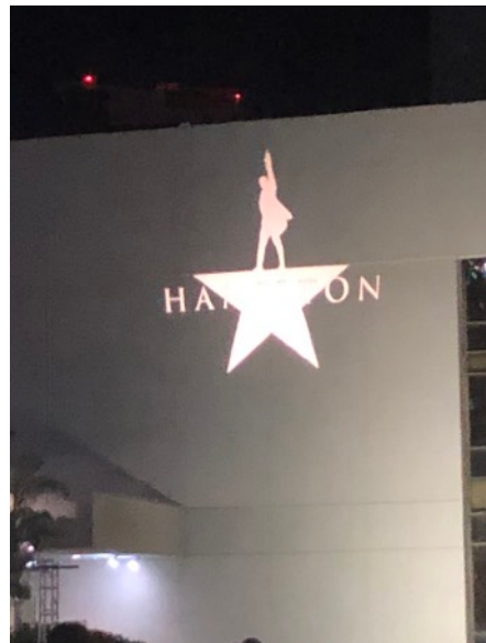
Bellas Artes Performing Arts Center is all lit and ready to receive the thousands who have come to watch Lin Manuel Marin bring Hamilton home!