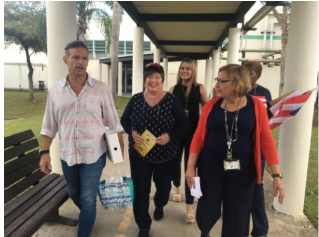
The team of escorts are all SMILES!