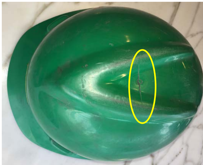
Figure 1 – Cracking in a Green Colored MSA V-Gard Protective Cap

MSA is issuing this Safety Advisory to inform you that MSA has received field reports that some green colored MSA V-Gard Protective Caps are cracking. The cracking occurs at the top of the cap, as shown in Figure 1, and is not caused by an impact to the cap. MSA has confirmed that the cause of the cracking is limited to green colored, medium size MSA V-Gard Protective Caps and that corrections have been made to prevent recurrence.