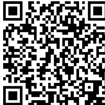
Exchanges and Commissaries