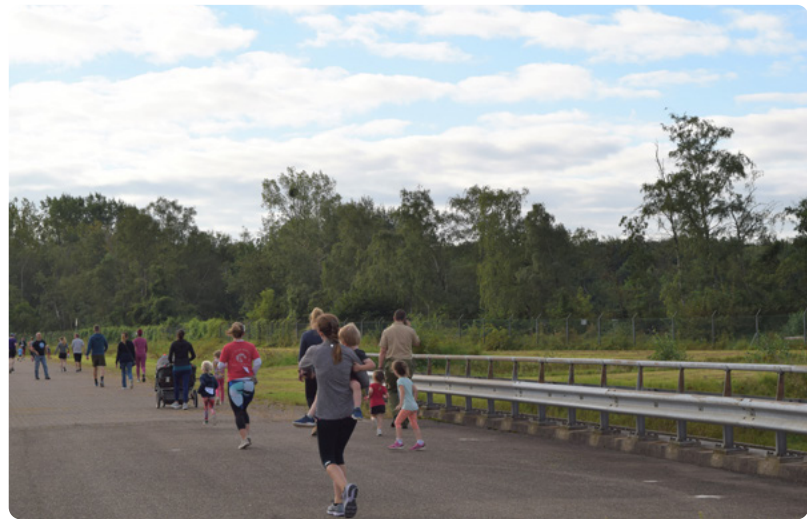
Members of the U.S. Army Garrison Benelux take part in the ceremonies marking the 20th anniversary of 9/11 in Brussels and on Chièvres Air Base, Belgium and in Brunssum, the Netherlands.