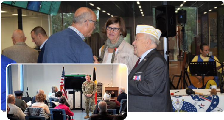
U.S. Army Garrison Benelux hosts U.S. Military Retiree Appreciation Day at Brunssum site and at SHAPE, Oct. 15-16, 2021.