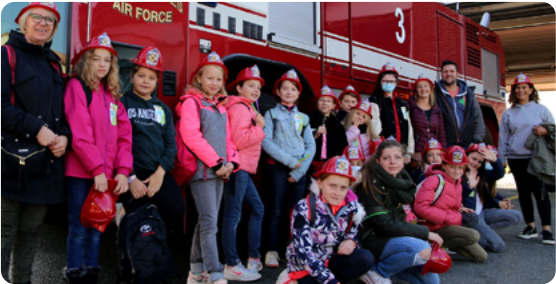
Local children visit with MPs and firefighters, Oct. 16, 2021 on Chièvres Air Base.