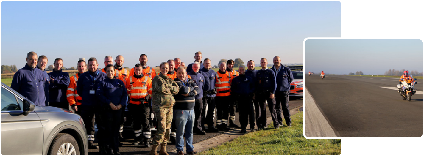
Belgian Highway Police test speed calibration on Chièvres Air Base Oct. 28, 2021.