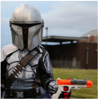
Communities across U.S. Army Garrison Benelux provide Families an opportunity to trick-or-treat on post during Trunk-or-Treat at Chièvres Air Base and in Brussels, Belgium Oct. 29, 2021 and in Brunssum, the Netherlands, Oct. 31, 2021.