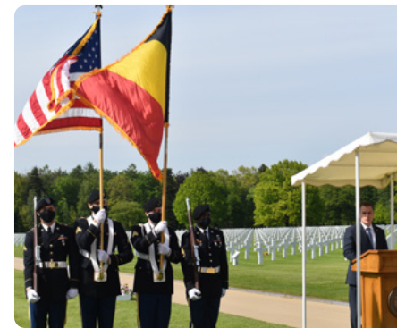
U.S. Army Garrison Color Guard performs their duties during the Memorial Day ceremony May 31, 2021, at the Ardennes American Cemetery in Neupré, Belgium.