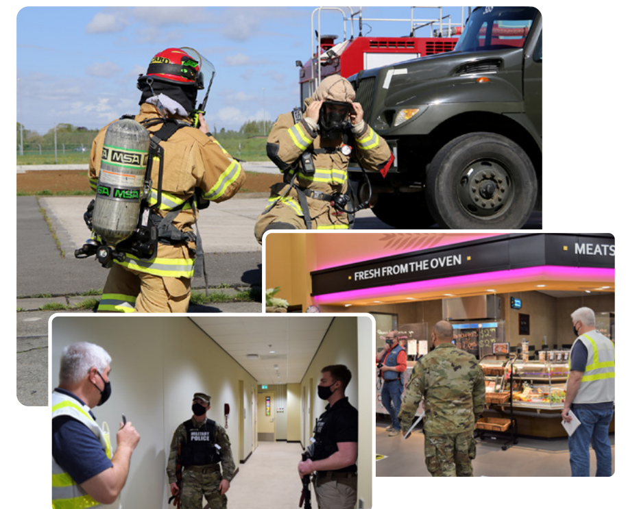
U.S. Army Garrison Benelux conducts a Hazmat exercise on Chièvres Air Base on May 12, 2021 and a DES exercise on May 21, 2021 in Brunssum.