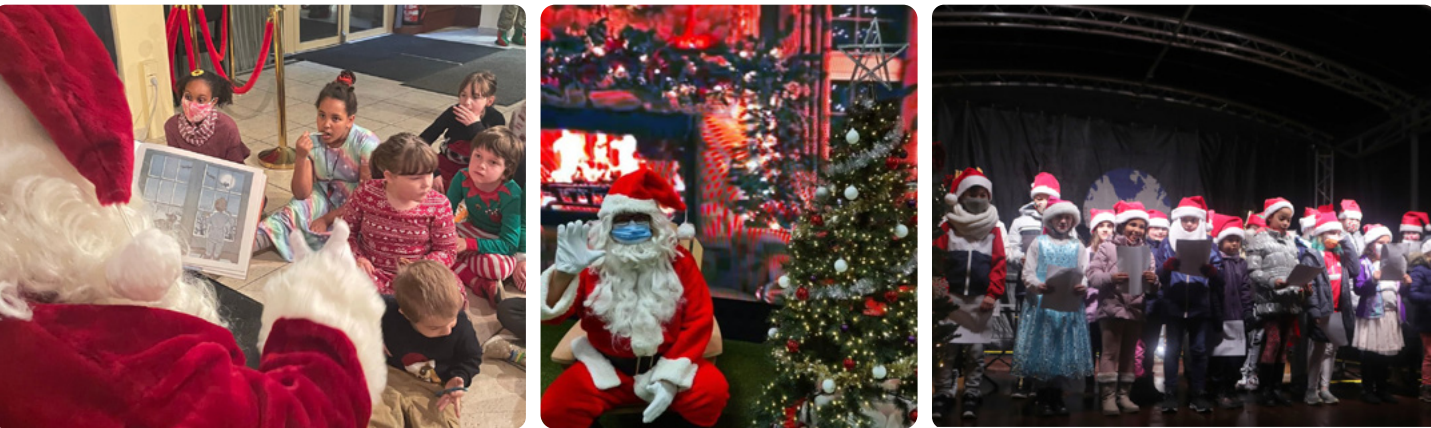
USAG Benelux celebrate Christmas time at different locations during the month of December.