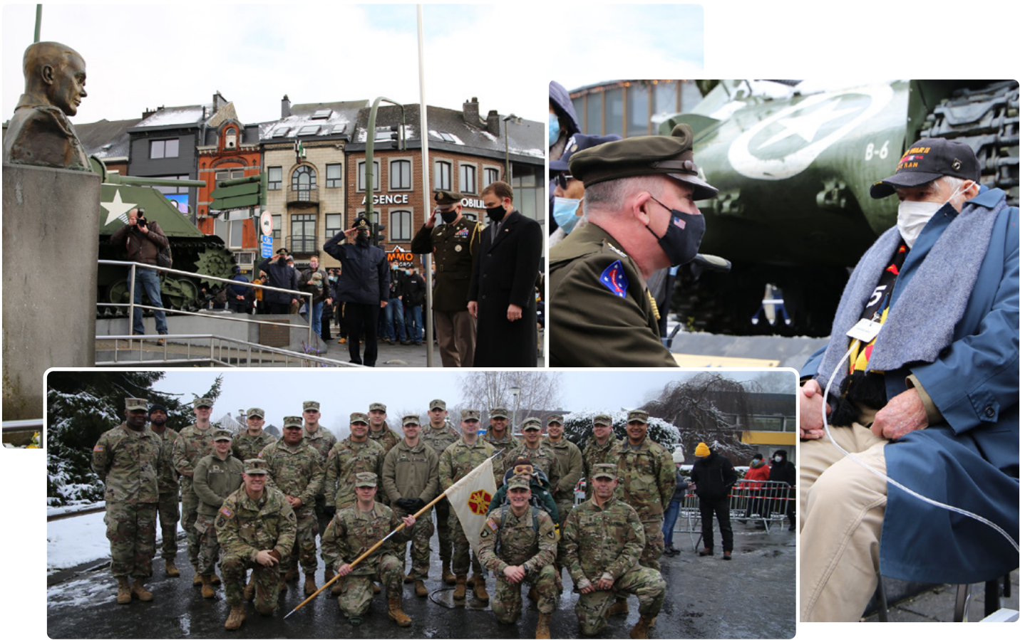
U.S. Army Garrison Benelux takes part in the 77th Anniversary of the Battle of the Bulge in Bastogne, Belgium on Dec. 10-11, 2021.