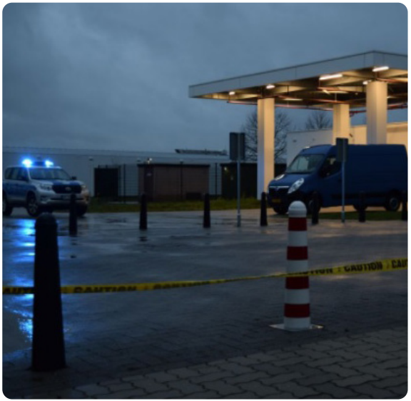
The military police responds to a pair of suspicious parcels that arrive at the installation’s community mail room during a training exercise Jan. 29 at the Brunssum Site of U.S. Army Garrison Benelux in the Netherlands.