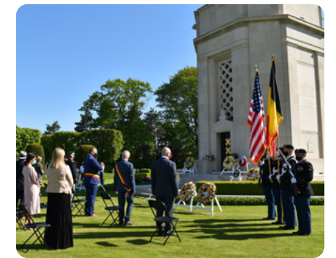
U.S. Army Garrison Benelux leaders and service members participate in the Memorial Day ceremony May 31, 2021, at the Flanders Field American Cemetery in Waregem, Belgium.