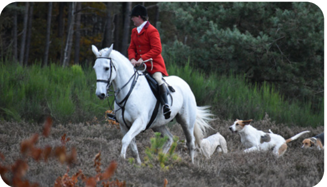
The town of Wiemesmeer, Belgium holds its 50th anniversary Saint Hubertus "slipjacht" (Dutch for "drag hunt") Oct. 31. Hounds and equestrians track an artificial scent trail around the forest, including onto the garrison's APS-2 Zutendaal.