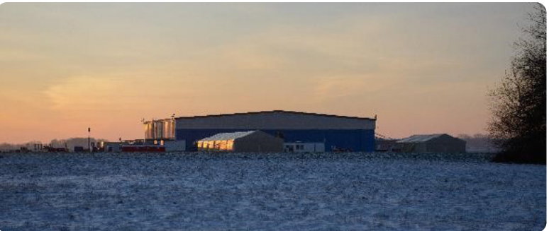
Temporary buildings surround hangars used as barracks, on Chièvres Air Base, Belgium, Feb. 12, 2021. Chièvres Air Base was a staging and quarantine area for Soldiers of the 1st Combat Air Brigade, 1st Infantry Division as they deployed in support of Atlantic Resolve.