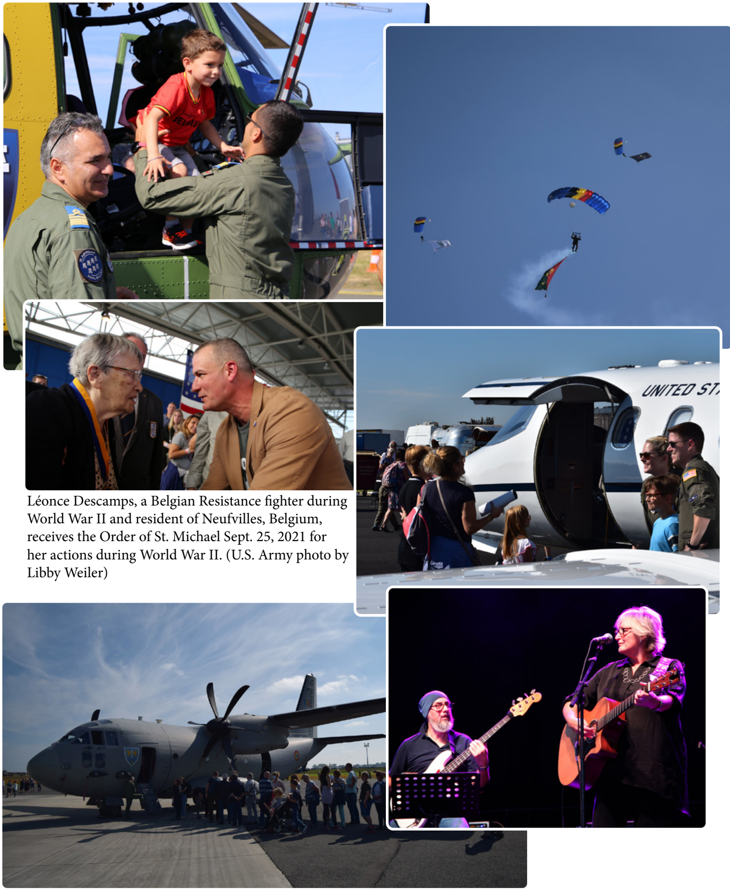
An estimated 15,000 Belgians, Americans, and other allied partners attend the inaugural Chièvres Air Fest, where they climb into static aircraft, interact with period-uniformed volunteers and historic vehicles, eat food from local vendors, listen to live music and watch fireworks.