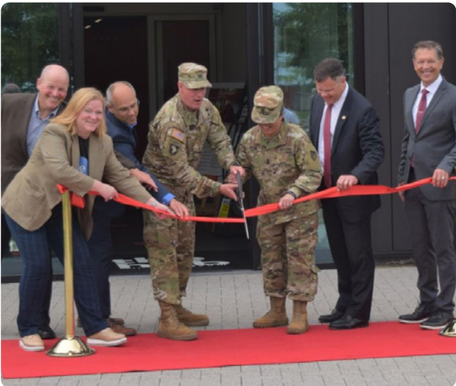
Leadership from Installation Management Command – Europe take part in a ribbon-cutting ceremony for the Hub, the Army’s premier open-concept indoor recreation facility, July 27 at its location at USAG Benelux in Brunssum.