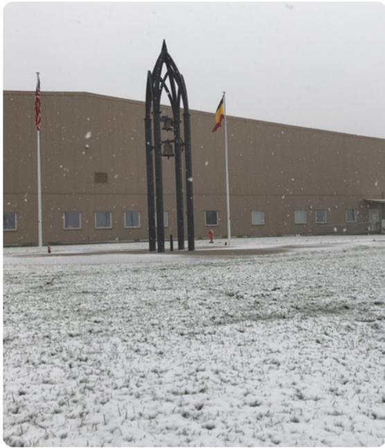
Snow on Chièvres Air Base Jan. 14, 2021.