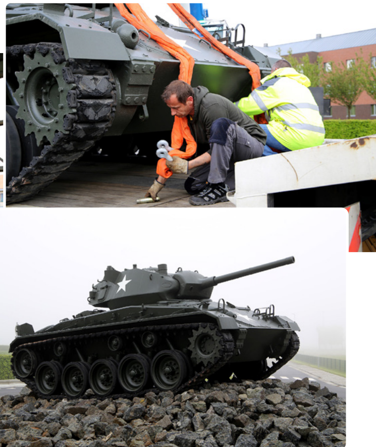
Chièvres Air Base welcomes a new tank on May 19, 2021 in Chièvres, Belgium.