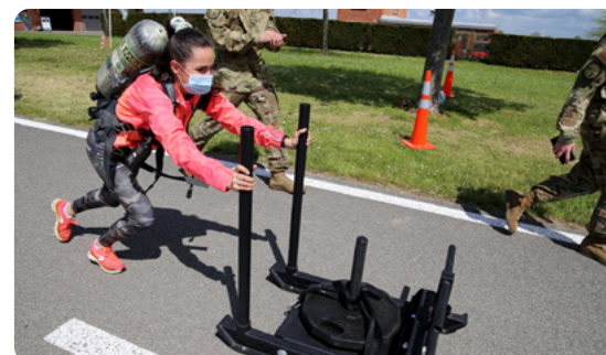
Spouses test their physical and mental fortitude during the "Spouse Challenge" on Chièvres Air Base May 14, 2021.