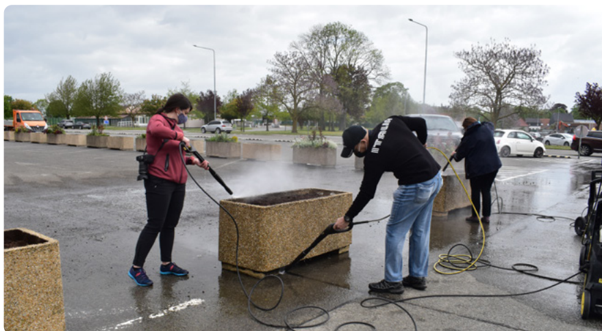
On Friday May 21, 2021, the entire USAG Benelux (all sites) participates in Area Beautification / Cleanup Day.