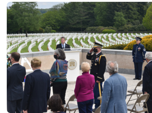
U.S. Army Garrison Benelux leaders and service members participate in the Memorial Day ceremony May 31, 2021, at the Henri Chapelle American Cemetery in Plombières, Belgium.