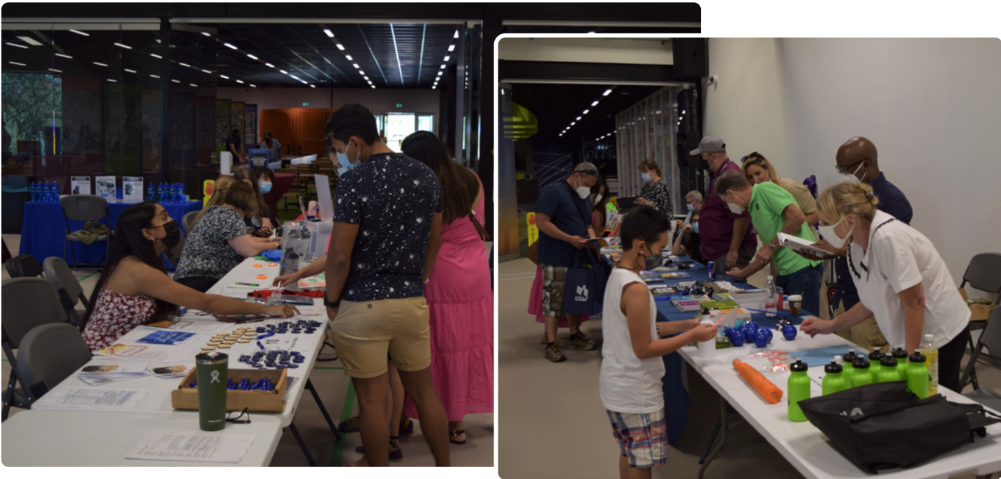
USAG Benelux in Brunssum welcomes folks from across the Tri-Border region with an aim for connection during the Benelux Welcome Expo on Aug. 14, 2021.