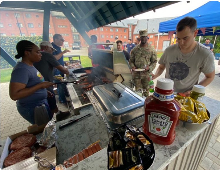
U.S. Army Garrison Benelux officially opens a new barbecue pit during a rain-pelted Sunday afternoon July 25, at the single service member quarters at Chièvres Air Base.