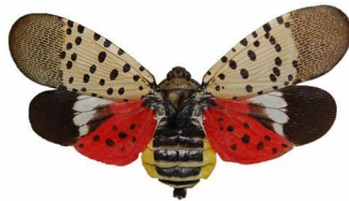
Figure 5. Spotted Lanternfly Adult, Wings Open