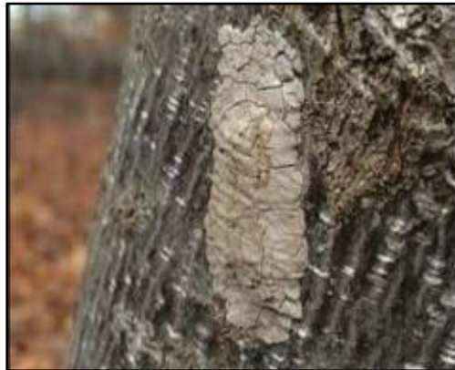
Figure 1. Spotted Lanternfly Egg Mass

Each year one generation of SLF is produced. Eggs are laid on hard surfaces (i.e. trees, rocks, houses, outdoor equipment, etc.) in the fall and hatch in the spring. Egg masses are covered in a mud-like substance to protect them and each mass contains 30 to 50 eggs (Figure 1).