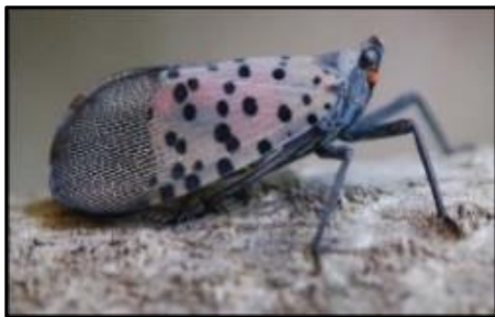
Figure 4. Spotted Lanternfly Adult, Wings Closed

SLF adults emerge in July and are active until winter. SLF adults are large (approximately 1 inch) and highly mobile, making this the easiest phase to identify. Adults have black bodies with brightly colored wings. SLF are better at jumping or hopping than flying, so their wings are more often closed. SLF wings are grey with black spots and, when fully opened, have bright red markings. Photos of SLF adults can be seen in Figures 4 and 5.