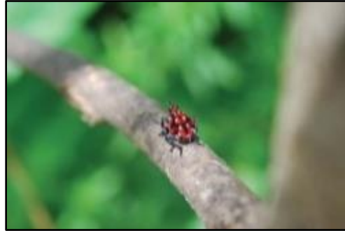
Figure 3. 4th Instar of the Spotted Lanternfly

SLF adults emerge in July and are active until winter. SLF adults are large (approximately 1 inch) and highly mobile, making this the easiest phase to identify. Adults have black bodies with brightly colored wings. SLF are better at jumping or hopping than flying, so their wings are more often closed. SLF wings are grey with black spots and, when fully opened, have bright red markings. Photos of SLF adults can be seen in Figures 4 and 5.