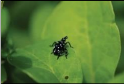
Figure 2. 1st-3rd Instar of the Spotted Lanternfly

After hatching, SLF go through four nymph (instar) phases. The first three instar phases appear black with white spots, while the fourth instar phase appears red with white spots and black stripes. First and third instar phases appear identical, but vary slightly in size. Figures 2 and 3 show the difference between the first three instar phases and the fourth.