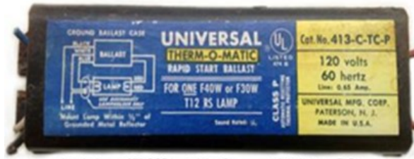
A typical pre-1979 PCB-containing fluorescent light ballast (FLB)