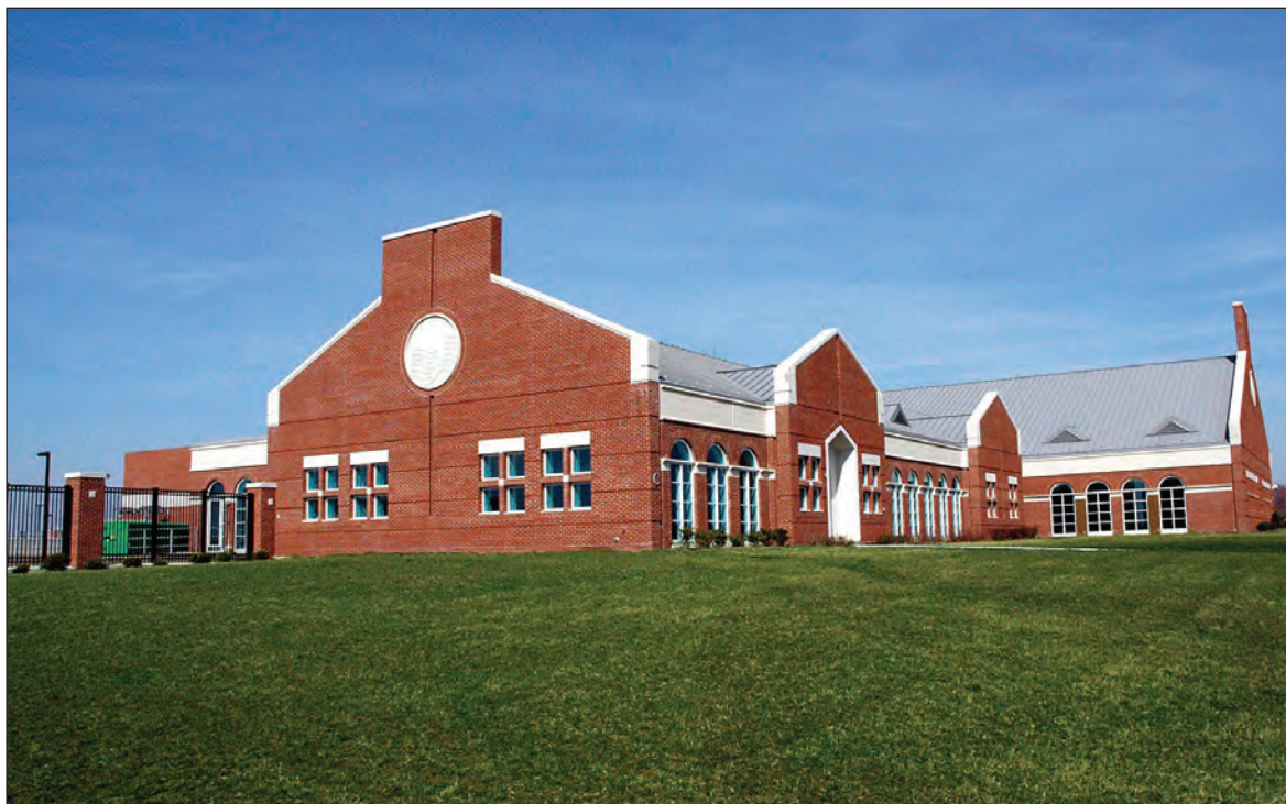
Fairfax Water's Frederick P. Griffith Jr. Water Treatment Plant