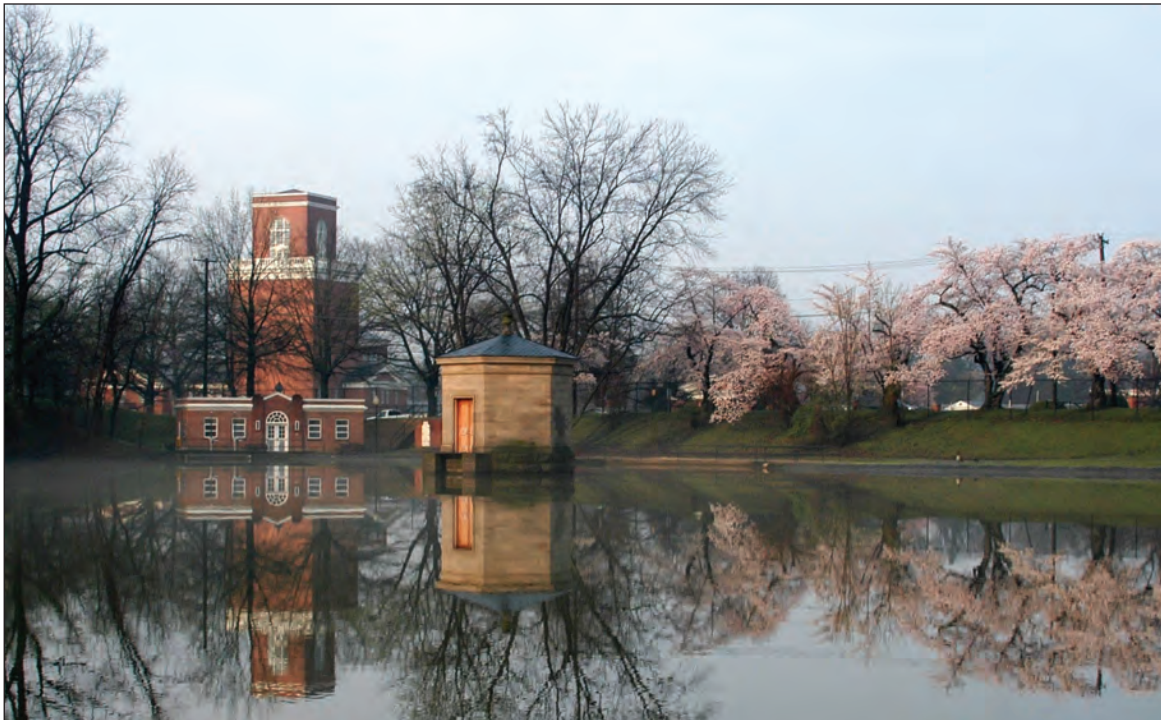
Washington Aqueduct's Dalecarlia Water Treatment Plant