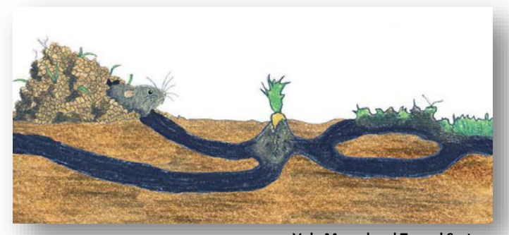
Vole Mound and Tunnel System

Unlike moles, voles may be legally expelled from their homes. Before taking any action, you must properly identify the animal as a vole or a mole. If both species are present, actions taken against voles can negatively affect moles. All questions and concerns regarding mound identification and possible actions can be directed to the USAG Bavaria DPW Environmental Division.