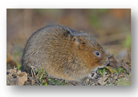
Vole spp.

Both moles and voles are in the rodent family; however, voles eat vegetation and plant roots, whereas the mole will not. In appearances, voles look more similar to mice in that they have small ears, open eyes and small paws compared to the mole.