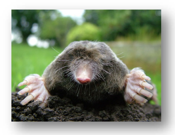
European mole

In Germany, moles are protected by law (§44 Federal Nature Conservation Law). It is forbidden to capture or kill moles without Host Nation Nature Protection Agency approval and a proper permit. It is important to identify the difference between moles and their close relative, the vole.