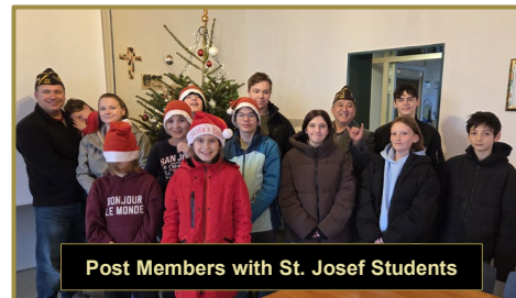
Post Members with St. Josef Students

Post 10557 joined the British Royal Legion to honor WWII sacrifices at Dernbach War Cemetery by placing Buddy Poppy flags on graves of four US Army-Air Force soldiers.