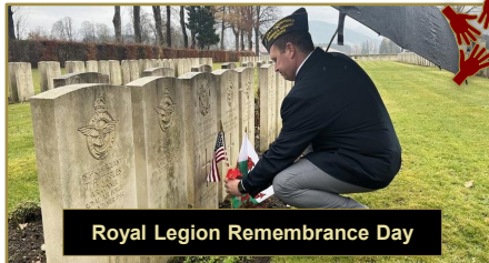
Royal Legion Remembrance Day