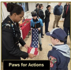
Paws for Actions

The third quarter focus is on social events to complement JMRC rotations and Post 2026 - 2027 preparations. Post games nights and luncheons resume in January to foster member engagement.