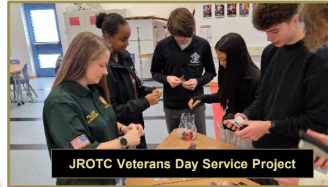
JROTC Veterans Day Service Project

Post members and ACS assisted a German spouse to secure $1,200 owed by her Servicemember sponsor in the US. The Post provided entitlement information and agencies to assist the spouse until the sponsor re-gained contact.