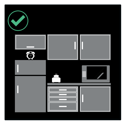
Always wear your face covering in all break rooms, common areas, hallways, and lobbies.