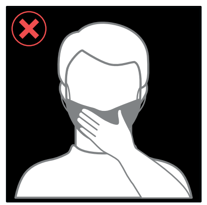
DO NOT touch the face covering while on your face or move it below your nose.