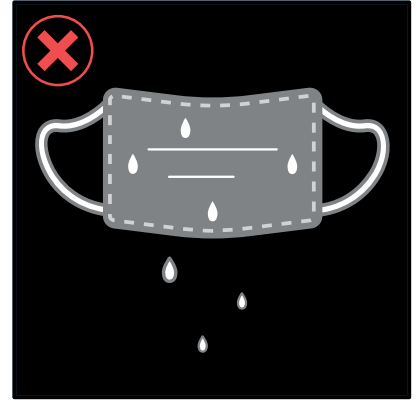
DO NOT wear your face covering if wet, and DO NOT flip it over to use the other side. Throw it away.