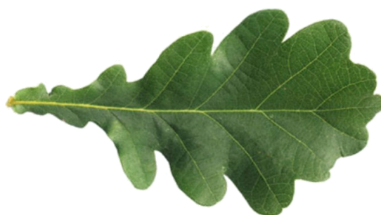
Typical oak leaf

Never approach or touch the nests or the caterpillars. Report any nests or caterpillars to DPW Pest Control at 587-1629 or 09641-70-587-1629.