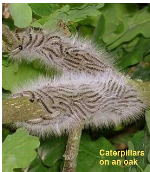
Caterpillars on an oak