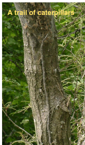
A trail of caterpillars