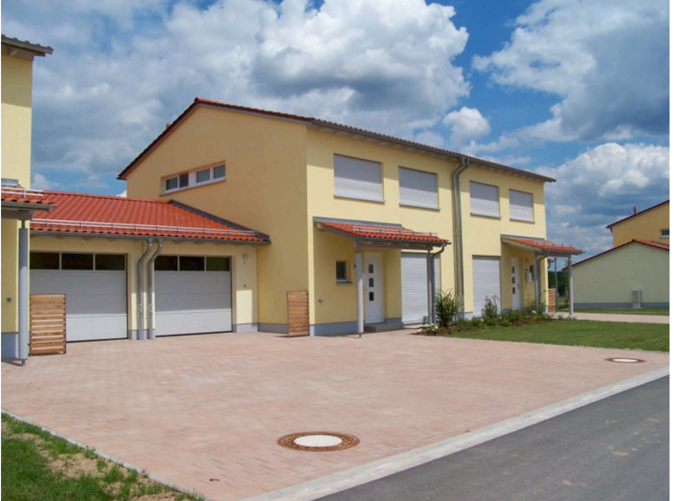
*Urlas Housing Area*