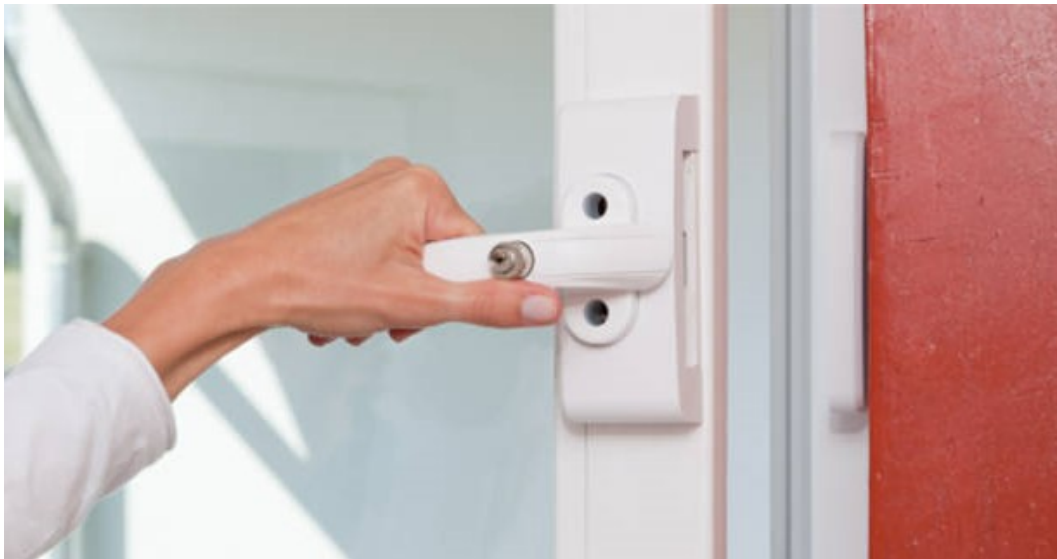
Windows with a locking window handle for child safety

Government quarters have windows with a locking window handle for child safety. Especially for parents, locking window handles of this sort are a good idea because they can control which windows children can open. The window key should be safely kept: once the window is closed push the key lock into handle. The key will release the lock and allow to open at least twice a day to air out. Don't keep the key in a window lock for convenience. Help to prevent a child from using it and accidentally opening a window.