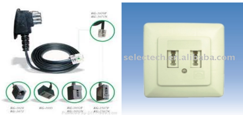
German Telephone Extension Cord

WARNING!!! It is illegal to own, operate, or sell cordless transmission equipment brought from the United States (e.g. walkie-talkies and baby monitors). Use of this equipment is illegal in Germany because radio frequency bands are used differently in Europe than in the States. Use of these transmitters may interfere with air traffic control, private business, radar security, mobile telecommunication providers and television. Using a frequency which is not officially assigned to you, whether knowingly or negligently, is an administrative violation which is regulated in section 55 subs. 1 S.1, section 149 subs. 1 no. 10 German telecommunications law. The penalty is a monetary fine up to Euro 500,000.00 according to section 149 subs. 2 no. 1 German telecommunication law.