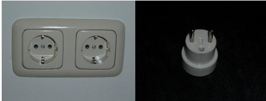
*German Power Outlet

The electrical current in Germany is 220 volts and 50 cycles. The majority of Government housing quarters have both 110- and 220- volt electrical outlets.