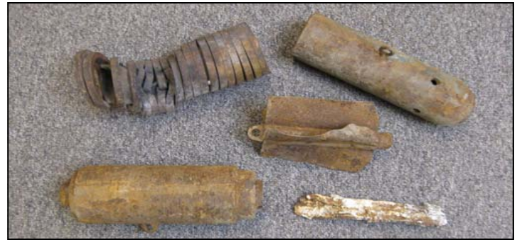
M47 20lb. frag bomb pieces

↙ This information is available for public viewing at the Fort Wainwright Administrative Record located in Building 3023, Fort Wainwright, in accordance with the 32 CFR Part 179 requirements. If you have or would like additional information about the sites listed above or other potential MMRP Sites associated with Fort Wainwright, please contact the USAG Native Liaison.